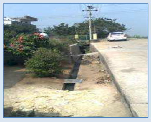
Slum: Yanadi Colony-Swarna road (Chirala ULB)

laying of drains. ULB proposed (October 2010) comprehensive survey of the drains for rectification for disposal of drain water. Thus, construction of the drains at a cost of ₹17.79 lakh did not serve the purpose. During the exit conference (December 2015). Government stated that corrective action had been taken by the ULB. However, it did not provide documentary evidence to this effect.