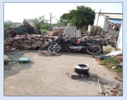
Slum: Hari Krishnanagar (Narasaraopet ULB)

existing gravel road on the other side of the slum was being used for transportation. The expenditure of ₹4.02 lakh incurred towards laying of CC road therefore, remained unfruitful. During the exit conference (December 2015), Government stated that corrective action had been taken by the ULB. However, it did not provide documentary evidence to this effect.